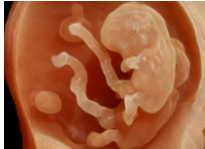
Nice 3D rendering of twins

A combination of detailed first trimester ultrasound and targeted cfDNA analysis streamlines care of twin pregnancies. When used in combination, these screening techniques enable early detection of chromosomal conditions, structural anomalies and pregnancies at risk for twin-to-twin transfusion syndrome with low false positive rates.