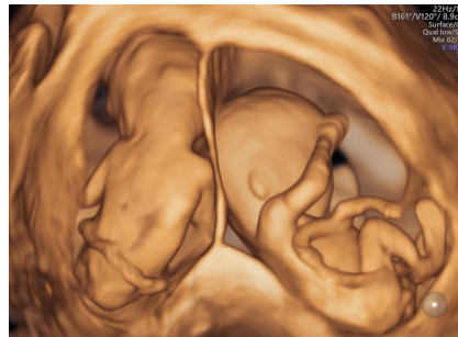
Monochorionic twins with 2 cord insertion – Image courtesy of Bernard Benoit