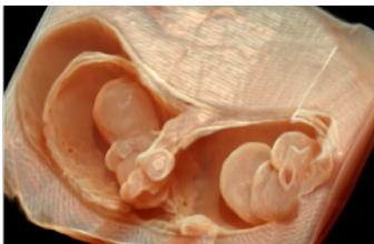
Monozygotic twins highlighted with HDlive – Image courtesy Bernard Benoit

Twin pregnancies are at higher risk for perinatal morbidity/mortality, structural anomalies, and chromosomal conditions. Compared with singletons, twins are at increased risk of preterm delivery due to maternal and fetal complications. 1-5 The risk is significantly higher in monochorionic compared to dichorionic pregnancy. 1-5 The first trimester assessment presents a unique opportunity to evaluate for potential complications.