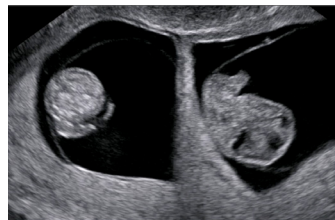
2D image of Dichorionic twins – Image courtesy Bernard Benoit

A detailed first trimester ultrasound is recommended for accurate assessment of gestational age, and chorionicity, which allows for proper triage of pregnancies at risk for pre-term birth and twin-to-twin transfusion syndrome. 1-5 It also enables identification of increased nuchal translucency and many major structural anomalies including fetal heart defects, that can be isolated or associated with genetic, chromosomal or other malformation syndromes. 6 This early evaluation provides information for pregnancy management including follow-up imaging and diagnostic testing options. 1-5